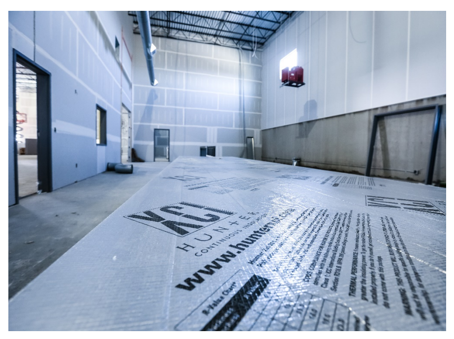
The new building is insulated with continuous, foil-faced polyiso insulation board.

The new building is insulated with continuous, foil-faced polyiso panels made by Hunter Panels, a Carlisle Construction Materials company. It also contains hot water heaters manufactured by Bradford White. Both companies are Hennecke customers.