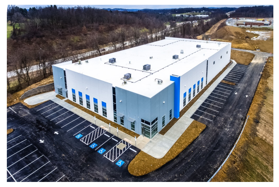
Hennecke Group's new North American headquarters in Bridgeville, Penn., just before finishing touches were added in February.

Hennecke Group, a global leader in the manufacturing and supply of polyurethane processing equipment and plants, has moved its North American headquarters to a new purpose-built facility south of Pittsburgh, Penn.